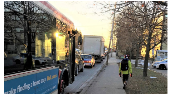
Backed up from Avenue Road.

BPRO has voiced our concerns to the municipal gov-